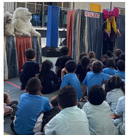
Brilliant at being Resilient Incursion