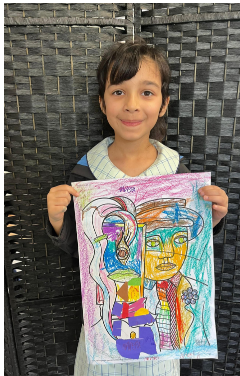
Year 1 Artwork