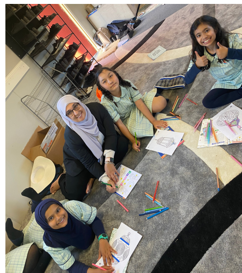
Girls Pastoral Care Club