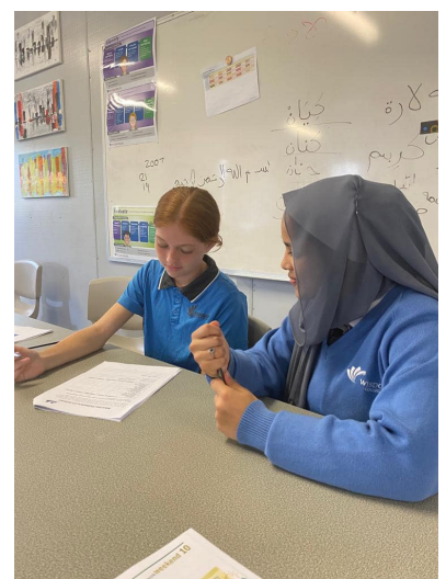
Peer Mentoring Program