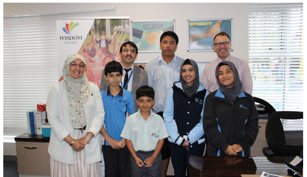
Family Trivia Night by our Community Engagement Department

I feel proud of what our College has accomplished in this short amount of time and of the amazing work from our teachers, students and College community.