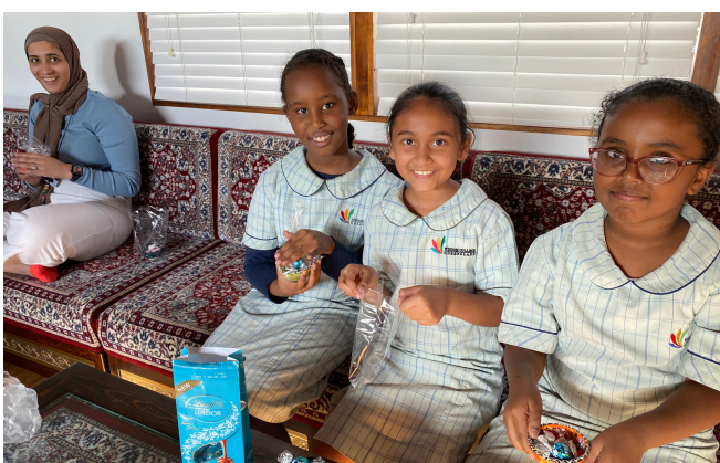
Pastoral Care Girls

I wish you and your families a most wonderful and blessed Eid.