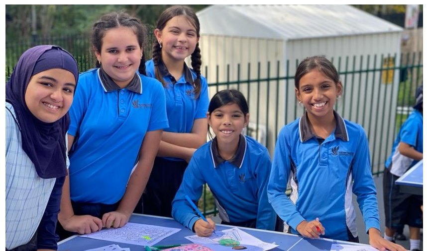
Year 5 Students