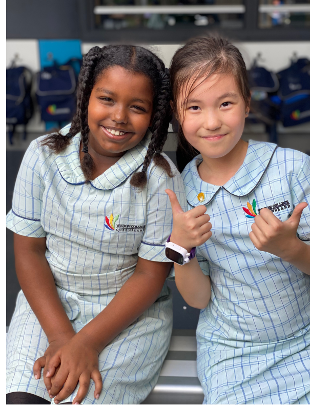
First Day Smiles!

Within the lower years our students are continuing to surprise and motivate their teachers to extend their learning and create lessons that stretch beyond the classroom. We have had parent teacher conferences this week and I have been delighted to see so many families taking the time to come and speak with their children's teachers. These conferences help families and teachers gain a greater understanding of how together we can support and mentor our students to succeed.