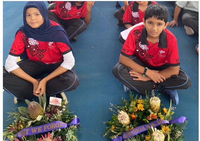
Anzac Day Assembly

Our camps this term have been designed to give students opportunities to develop their skills around confidence, leadership, problem solving and team building.