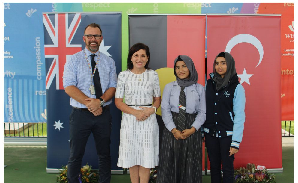
Anzac Day Assembly

Finally, we are exploring a range of literacy programs at our College. Improved literacy amongst all of our students will deliver increased opportunities, career prospects and life expectancy. Therefore we are building two small outdoor libraries, where books will be available to borrow. One in the Primary and one in the Secondary. It is based on goodwill where a book can be taken and then returned when finished. To get us started I am asking for book donations from families. Please send in any books that you are happy to donate for other people to read. Books for all ages, genres, fiction and non-fiction. Together we will improve the literacy of our entire College community.