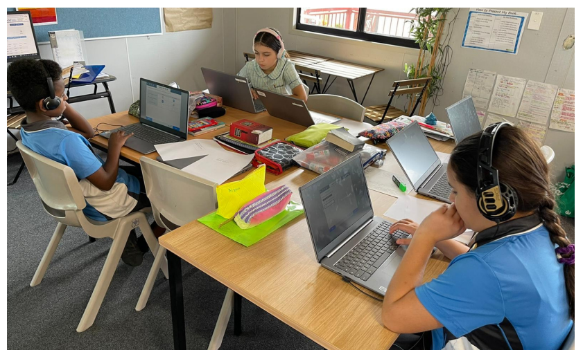
Naplan Practice Tests