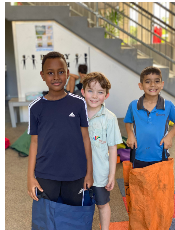
A FUN FILLED UNDER 8'S DAY

At Wisdom our primary goal is to spark a love for learning and praising students for effort not intelligence or results. Reminding students the power of the word 'yet' as in 'you are not there yet but will be'. Students are always reminded about the importance of making a mistake, explaining how mistakes are an opportunity to learn. Through our You Can Do It program we teach our students how to be persistent and always believe that anything is achievable if you believe in yourself.