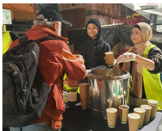
HOMELESS RUN VOLUNTEERS