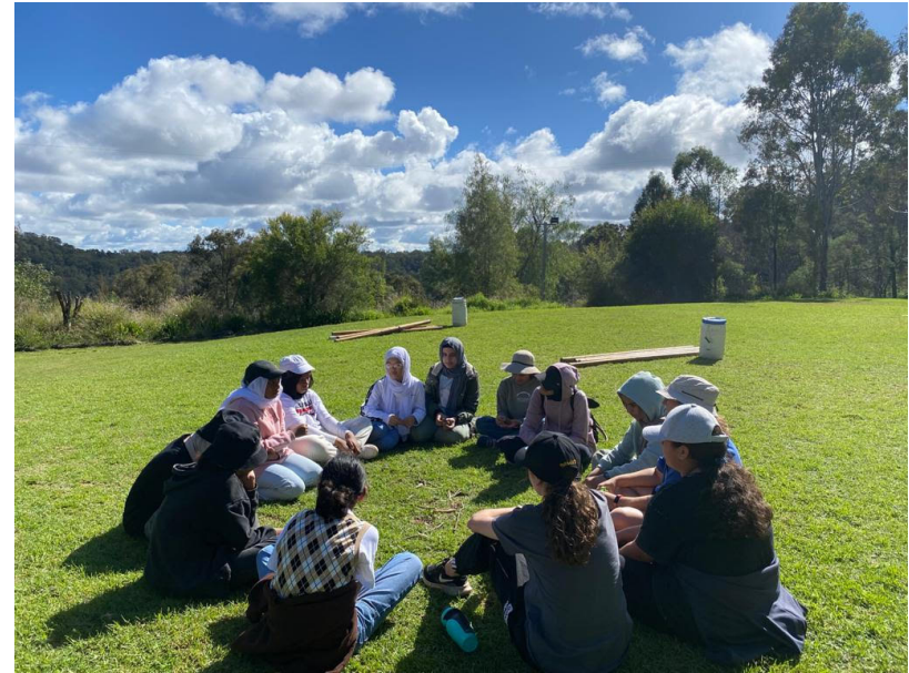
YEAR 7&8 GIRLS REFLECTING ON THEIR TIME AT CAMP

At Wisdom our primary goal is to spark a love for learning and praising students for effort not intelligence or results.