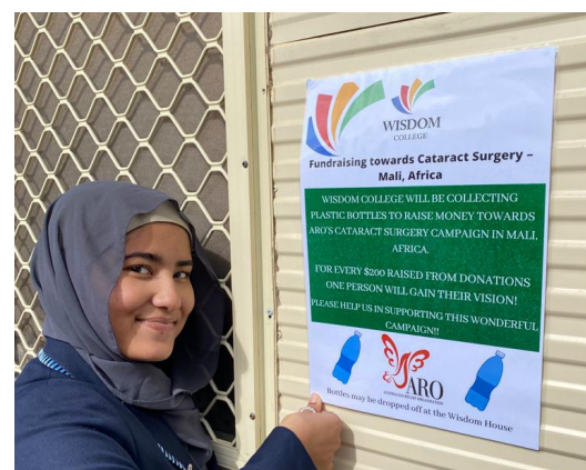
FUNDRAISING FOR WONDERFUL CAUSES