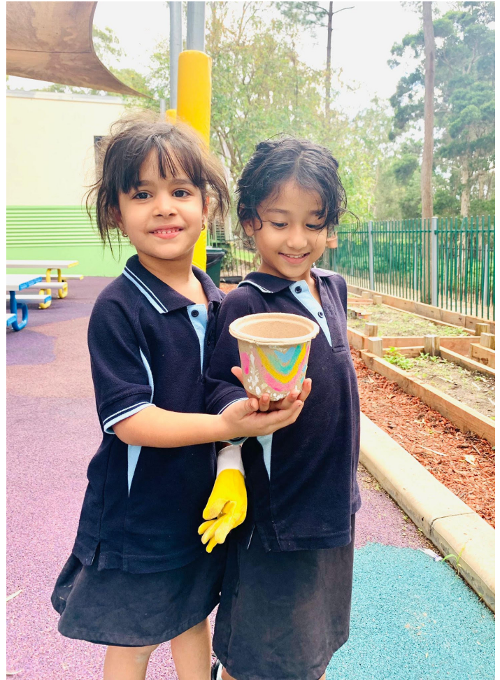
OUR PREP STUDENTS, LEARNING AND GROWING EVERY SINGLE DAY

The Preps have been working so hard and doing a lot of amazing learning in Term 2. It is wonderful to see how far they have come since the beginning of the year! This term we have placed a big focus on inspiring a love of reading in the students. It is so important they feel excited and motivated about learning to read! Each week the Preps focus on one book and engage in a range of fun activities linked to that story. They have acted the story out, presented it as a puppet show, and created crafts and sentences that link to the story. As well as reading, the students have been learning all about living things, places, and working on their maths skills. They have planted sunflowers and seedlings, explored the importance of caring for places and how Indigenous Australians care for the Country. We have loved watching the Preps grow in confidence and can't wait to see how they continue to thrive at Wisdom College!