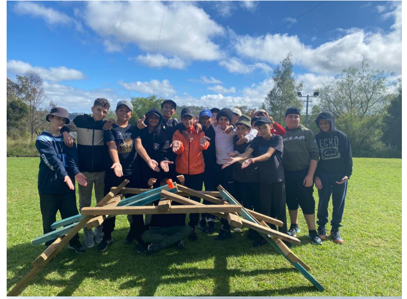
YEAR 11&12 AND YEAR 7&8 CAMPS

As the term draws to a close we will have some very exciting futsal competitions which I look forward to sharing with you in my next newsletter. I will also talk a bit more about our 'Wellbeing@Wisdom Framework which we are very busy working on. Lots of exciting projects are on their way which I will share with you all very soon!