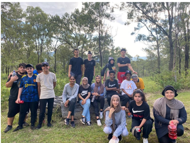
YEAR 11&12 CAMP

A reminder to parents that next Tuesday 31st of May is our Parent Information Evening for grade 10 parents. We look forward to welcoming each parent of our grade 10 cohort on this night.