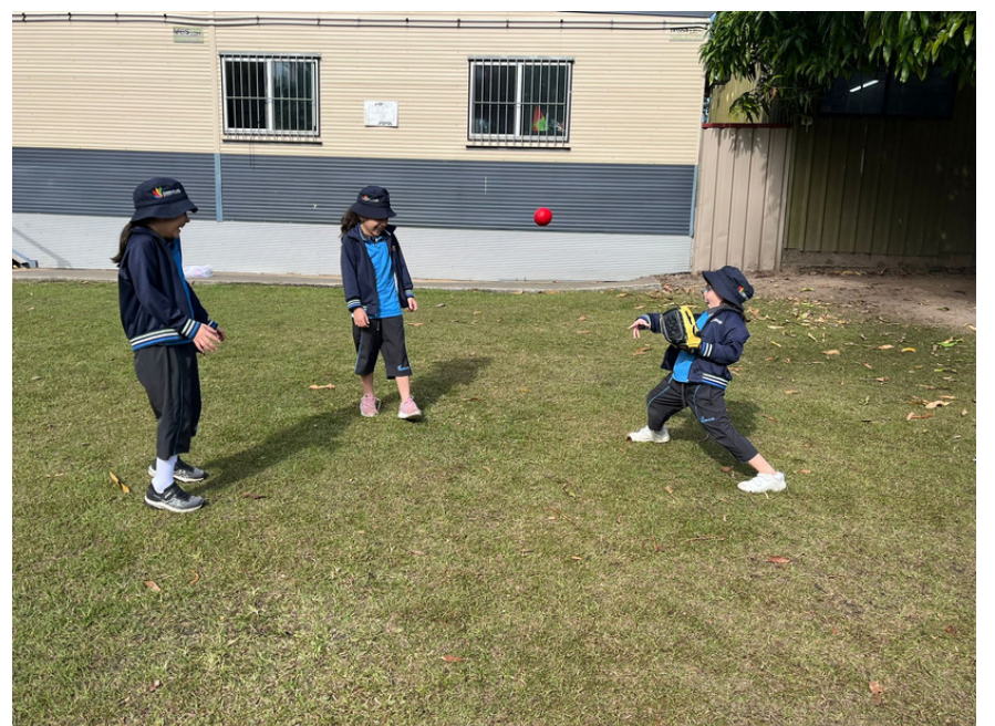
PRIMARY STUDENTS ARE BACK INTO THE SWING OF THINGS

Lastly, please ensure you are keeping yourselves up-to-date with all our primary news by logging onto your My Wisdom Accounts and reading the weekly news blog. My Wisdom is also where you will be able to find curriculum information for your children. We are still creating an APP for this system and appreciate your patience and understanding regarding this. Emails also need to be checked daily as this is now the main form of communication between College and home. If you are not receiving emails, please check with the front office that we have your current email address.