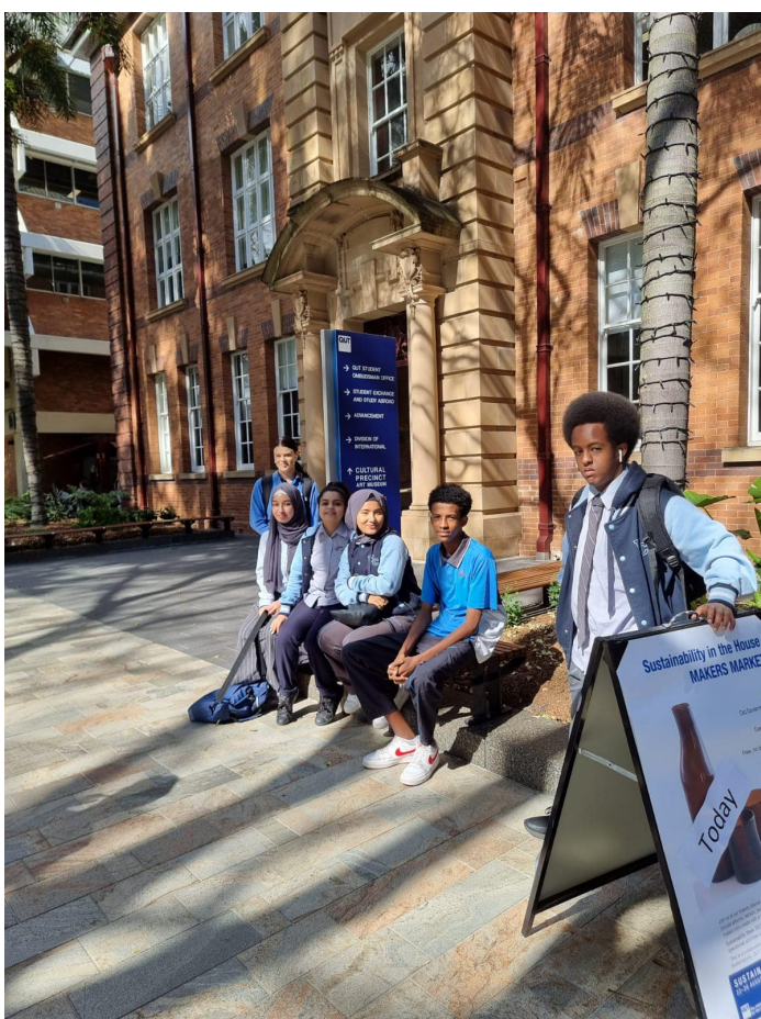
YEAR 12 EXCURSION