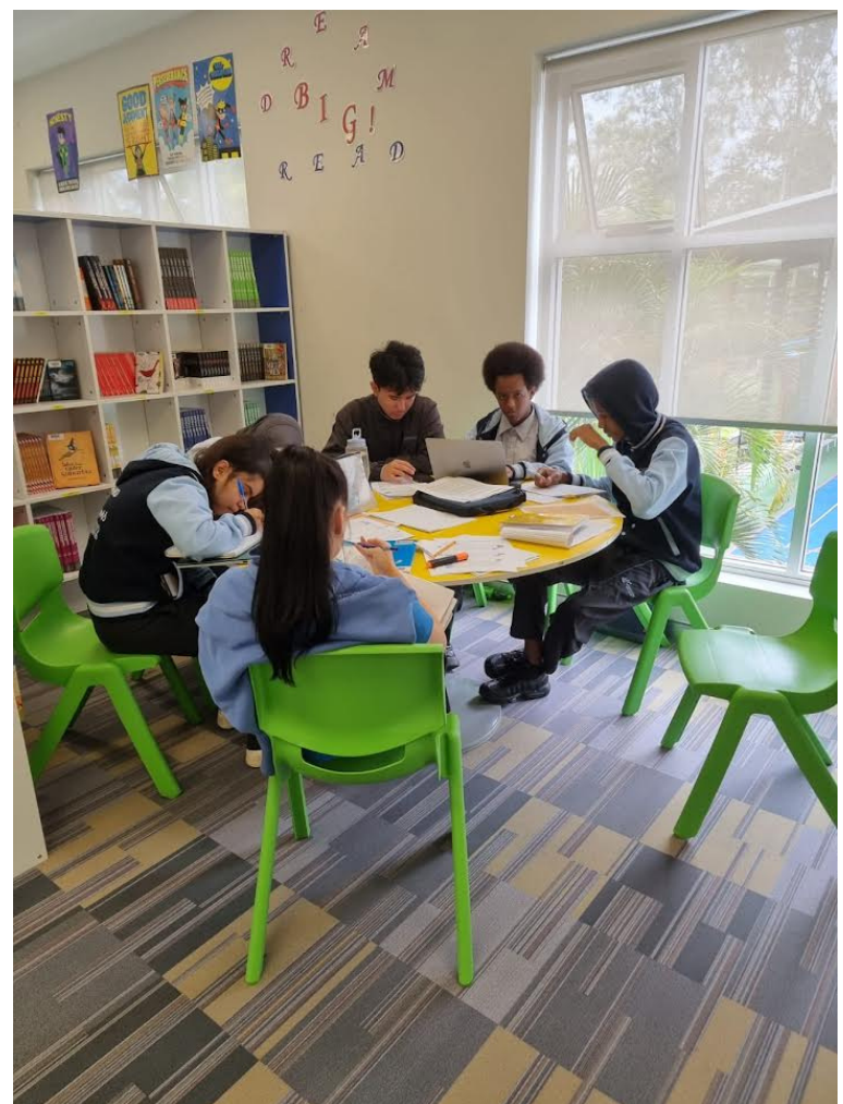
YEAR 12 STUDENTS

Success is no accident, it is hard work, perseverance, learning, studying, sacrifice, and most of all, love of what you are doing or learning to do.